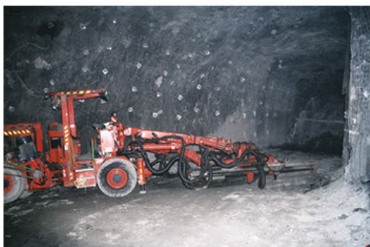
Photograph 1 Side view of the drill jumbo

It would have been simple to position the feed beam on the ground (see photograph 2) before attempting to remove the check valve. This would have eliminated any possibility of the feed beam rotating.