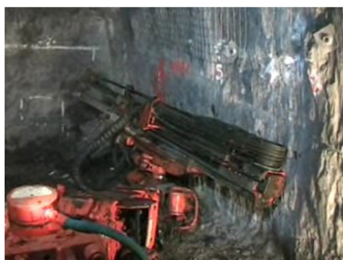
Photograph 4 Reconstruction showing position of the feed beam after the incident