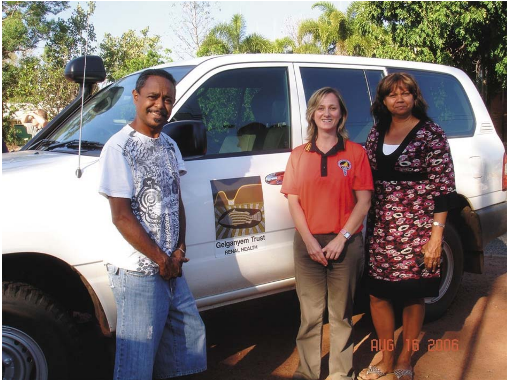
SD07 A CLIMATE FOR CHANGE