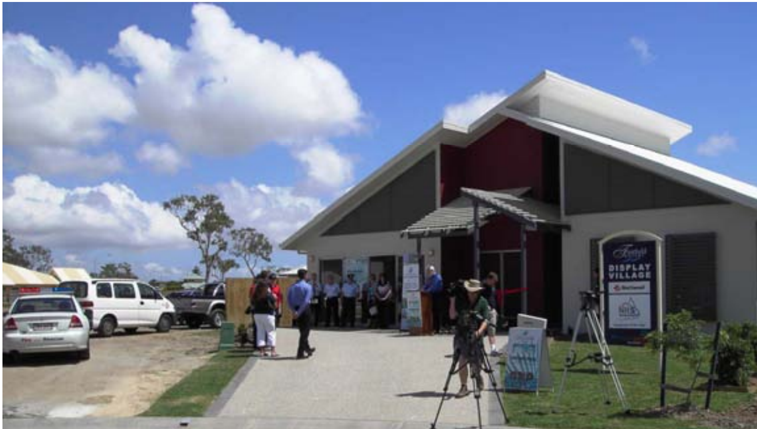
Child Safe House