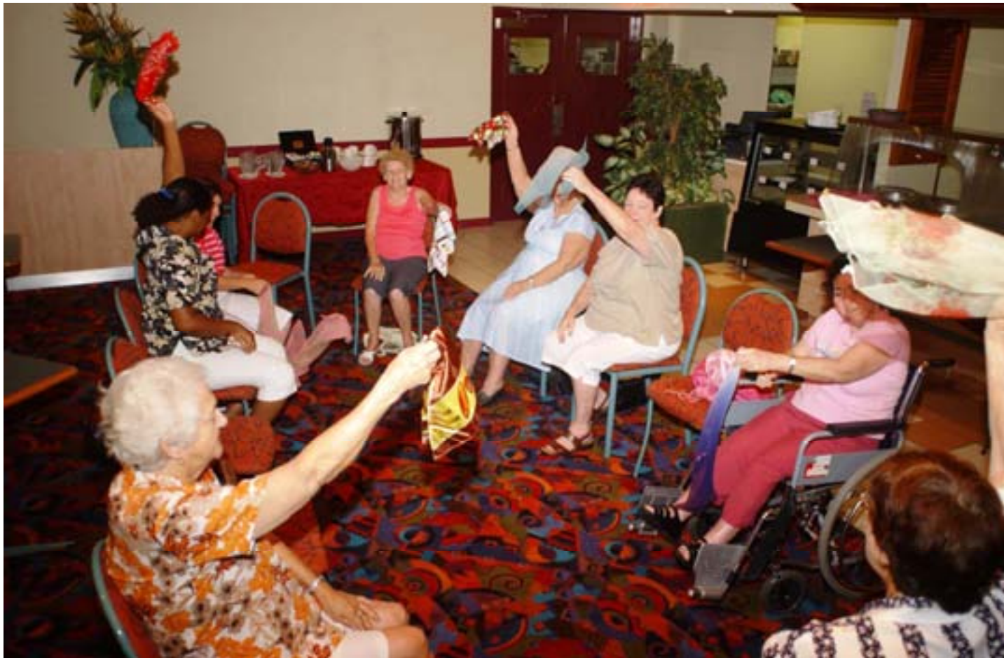
Active Ageing Activities