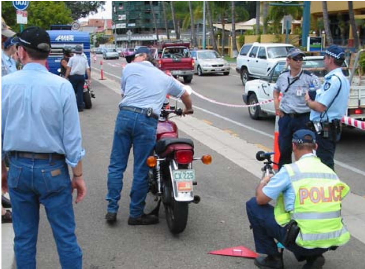
Motorcycle Awareness Week