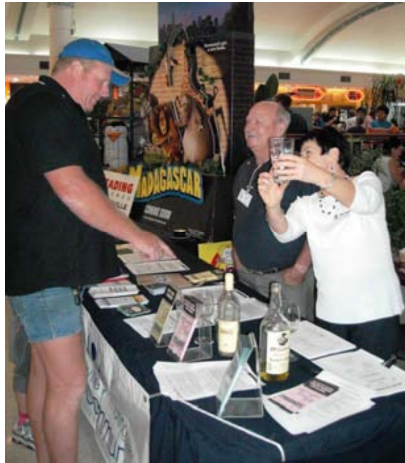
Alcohol Awareness Campaigns