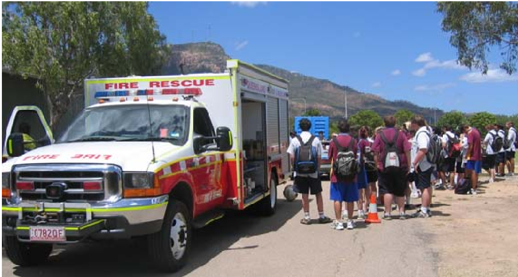
Young Adults Road Awareness Pilot